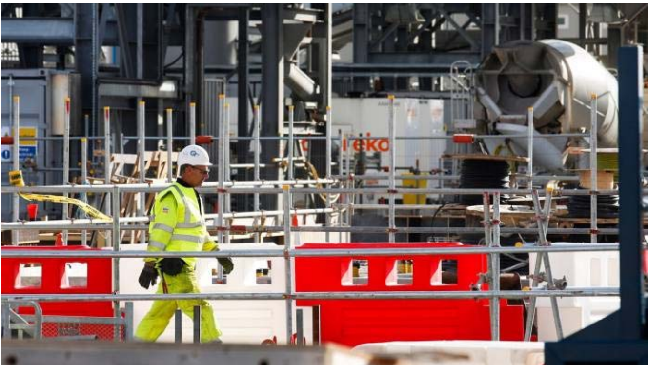
A site worker walks through the concrete batching plant at the Hinkley Point C nuclear power station

Although EU lawyers had long concluded that Article 50 notification would apply to the Euratom treaty as well, the UK government had until now insisted it was still considering the implications of the Brexit vote for its membership of the organisation.